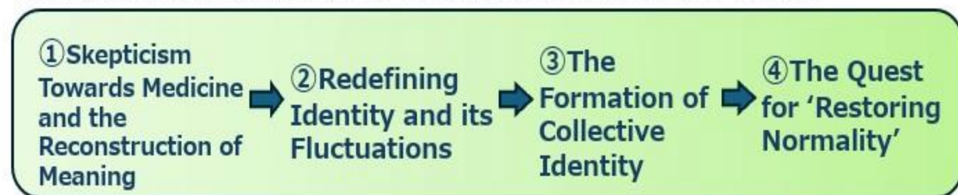
Four-Stage Model of Victim Transformation (Ikawa, 2025)

※Each stage is a convenient classification. In reality, they overlap and are fluid.